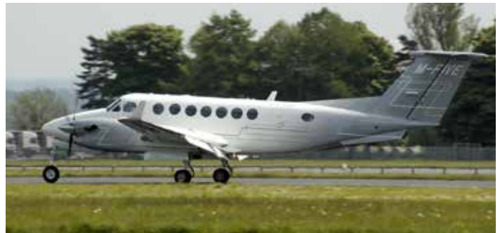
Beechcraft KingAir 350

System capabilities include flight plan display, navigation inputs from GAMA ARINC 429 sources, target position transmission and a 20-target Track-While-Scan (TWS) processor providing location latitude and longitude, target heading and velocity.