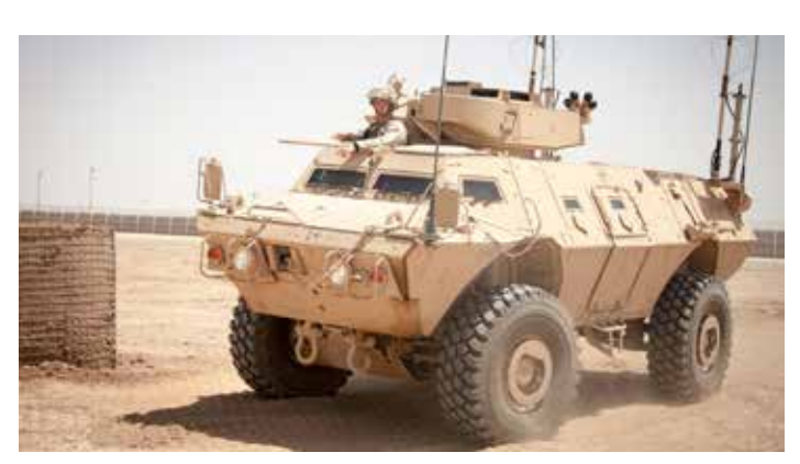
Mobile Strike Force Vehicle (MSFV)

The system offers an integrated capability for dismounted crew and personnel to maintain communications among themselves and command with Telephonics' TruLink® Wireless Intercommunication System. The simple modular configuration of the NetCom system results in common LRU implementation across all ground vehicles and the ability to provide a complete